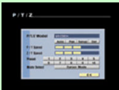
Remote Access Display